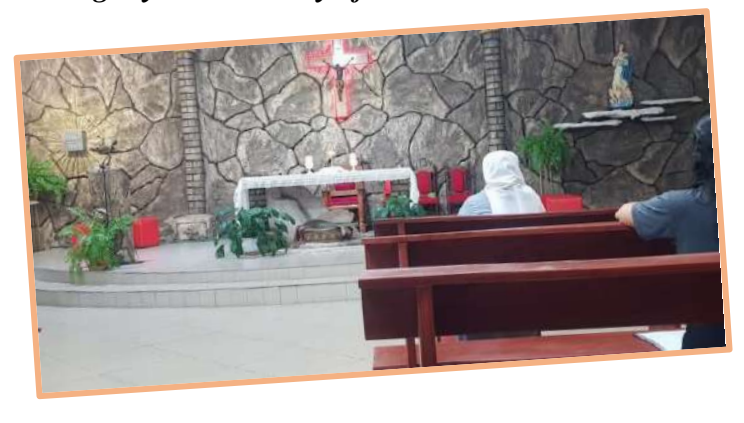
Paraguay: Community of San Juan de las Misiones