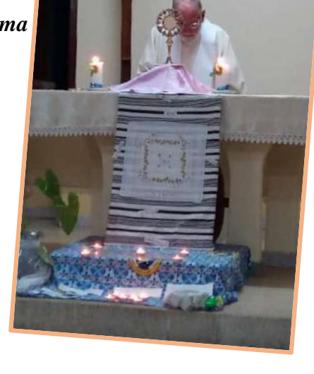
Philippines: Community of Caloocan, novitiate