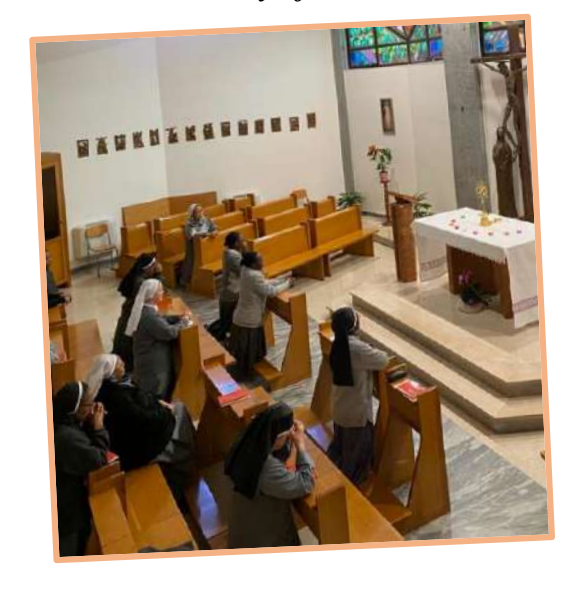
Rome: Community of the Generalate House