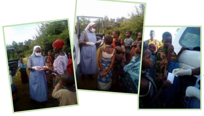
Community of Tabora (Tanzania) Evangelization and human promotion.