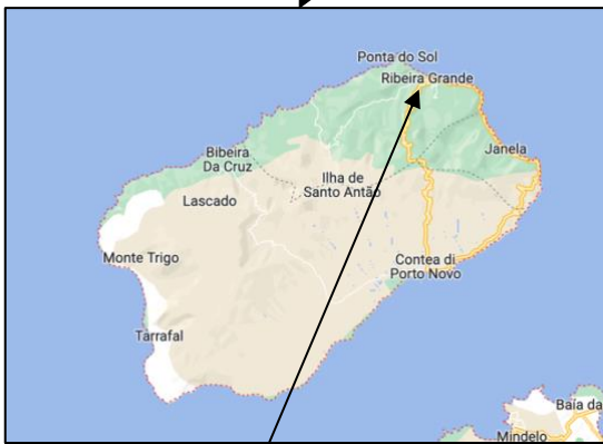
Island of Santo Antão: Community of Ribeira Grande